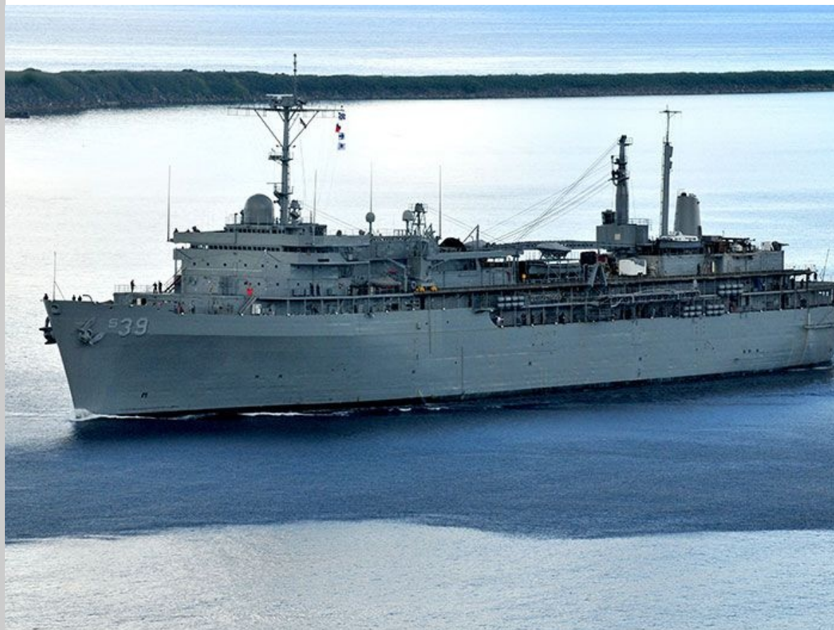
USS Emory S. Land (AS 39).

Mare Island Dry Dock, LLC , located on Vallejo's Mare Island, has been awarded a contract with the U.S. Navy for the submarine tender USS Emory S. Land (AS 39) , a ship that supplies and supports submarines. The contract includes repairs and maintenance to the ship, which will be commencing in June 2018 with anticipated completion in September 2018.