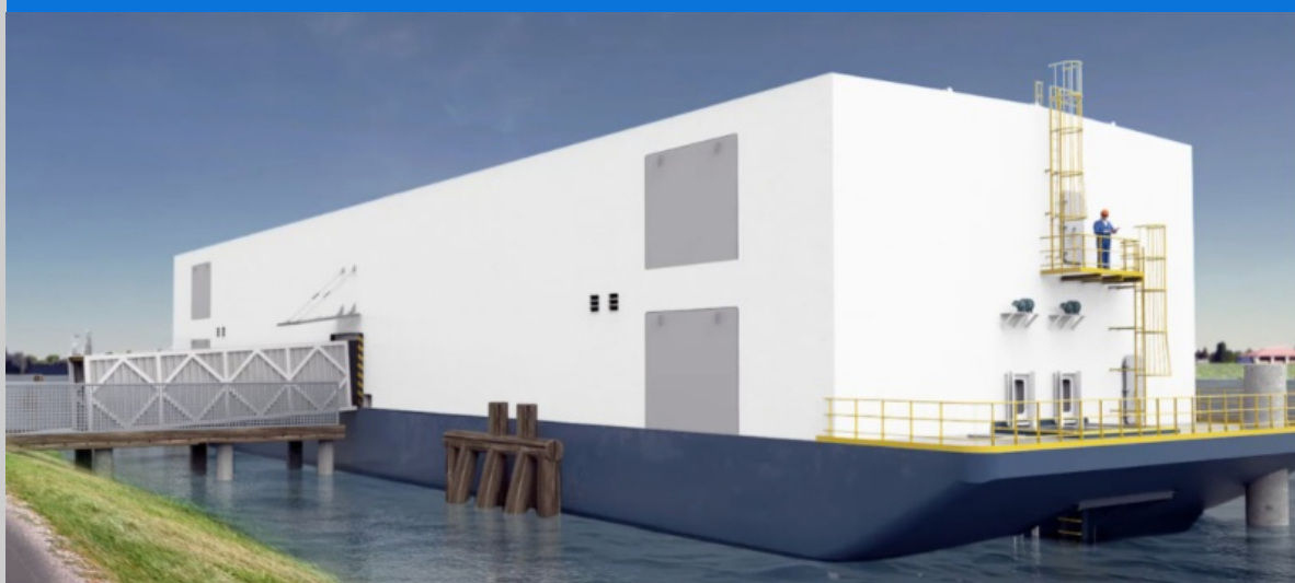
Mare Island Nautilus Data Center.

Lennar Mare Island , master developer of approximately 650 acres on Mare Island including residential and commercial space, released its April 2018 progress report of recent business and commercial activity on its portion of the island.